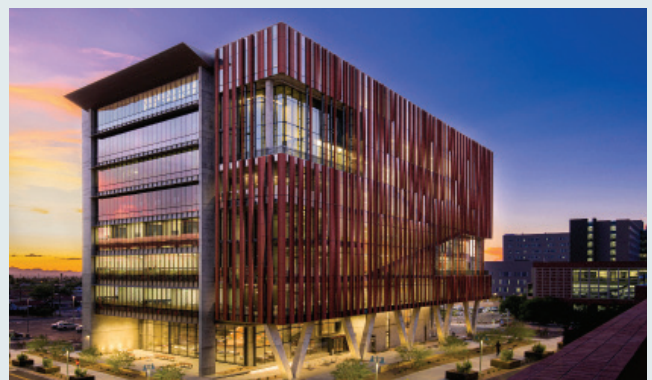
Health Sciences Innovation Building, Tucson